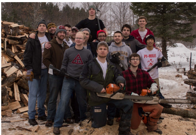
All of the Brothers who helped cut wood for Little Brothers: Friends of the Elderly last semester