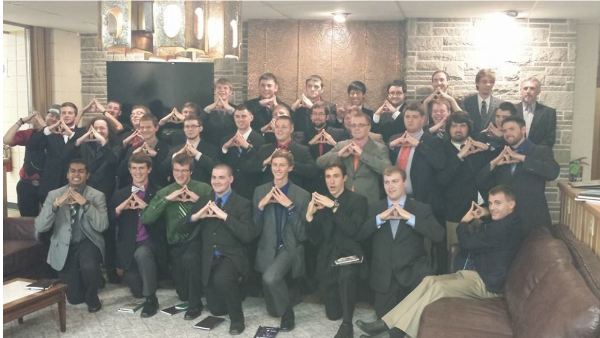
Photo from the Fall 2014 Pining Ceremony