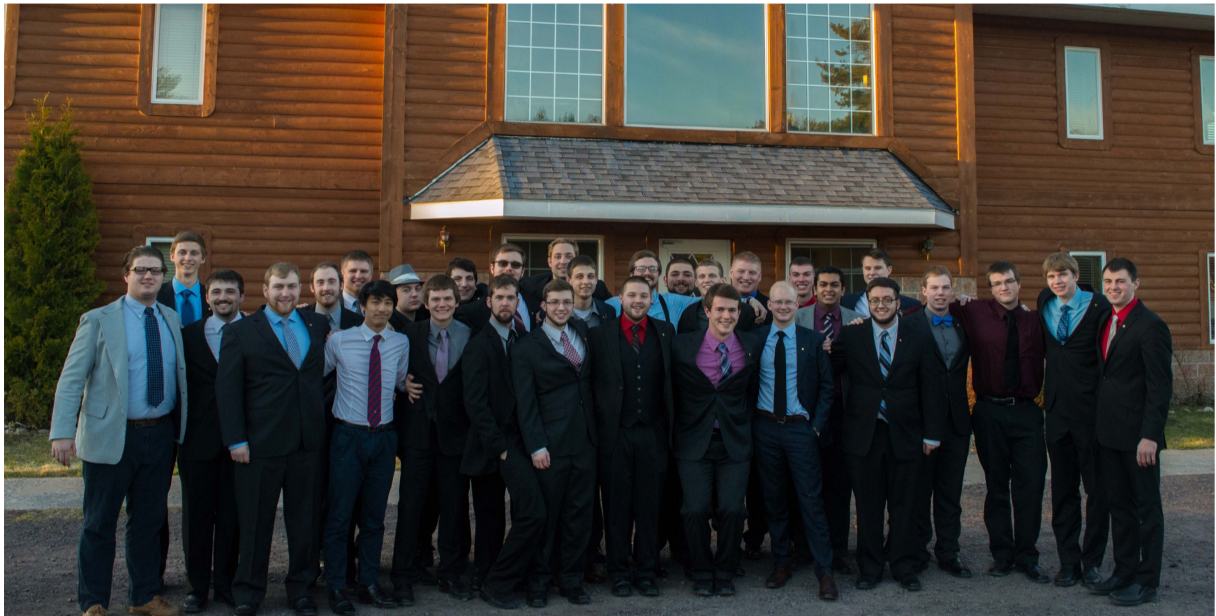
Photo from 2015 Formal